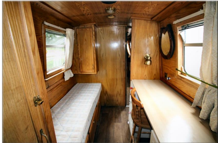
Single cabin: Storage room to part aft, Single bed going length way along port wall, desk and cupboards along starboard wall. Passageway continues forward into ...