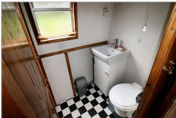
Bathroom: All to port. White ceramic basin with cupboard beneath against wall. Pump out toilet to centre against aft bulkhead. Bath tub with shower against forward bulkhead. Passageway continues forward into ...