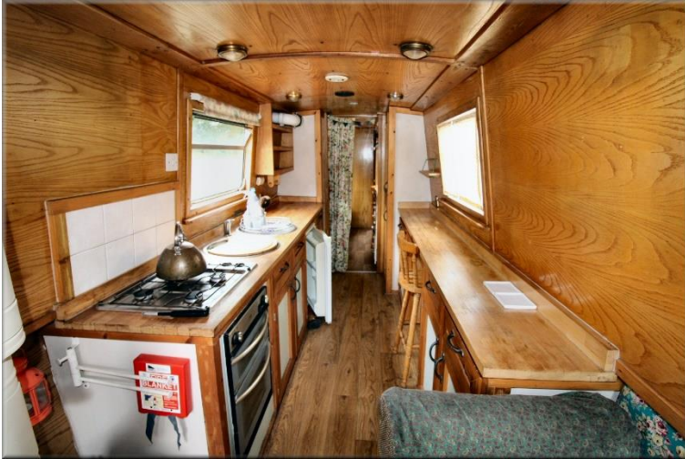
Galley: Inset 4 gas hob oven and grill cooker to port, Inset stainless steel sink and drainer unit further forward, fridge and cupboards under counters. Breakfast bar and cupboards along starboard.. Passageway continues forward into ...