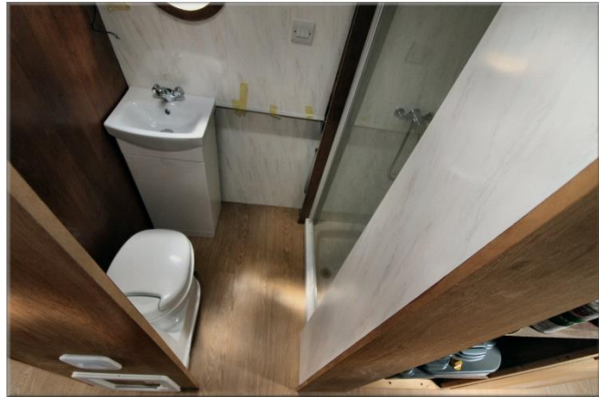
Bathroom: Stand-in shower to aft, Inset white ceramic basin to port, pump out and chemical toilet forward with shelving opposite. Passageway continues forward into ...