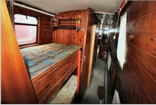
Triple cabin: Bunk beds going lengthways to port with a small double below and a single above. Passageway continues forward into ...