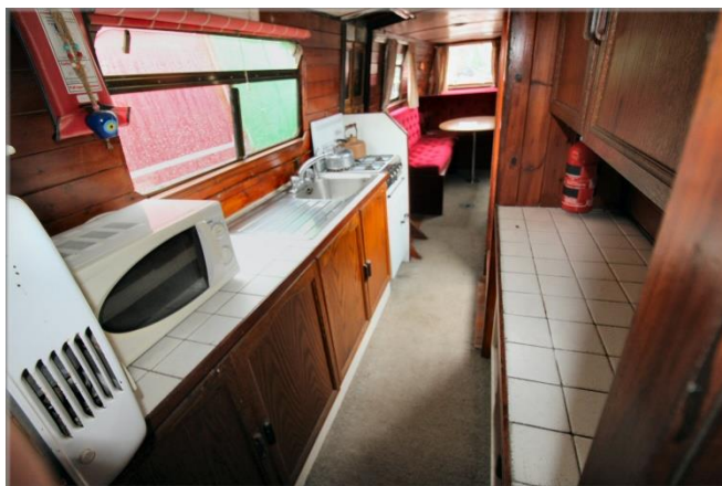
Galley: Storage cupboard to aft port, Counters on both sides with cupboards below. Inset single bowl stainless steel sink and drainer unit to port. Washing machine and fridge inside the cupboards with a microwave oven above. 4 gas hob oven and grill cooker further forward. Steps up to starboard side door. Open plan forward into ...