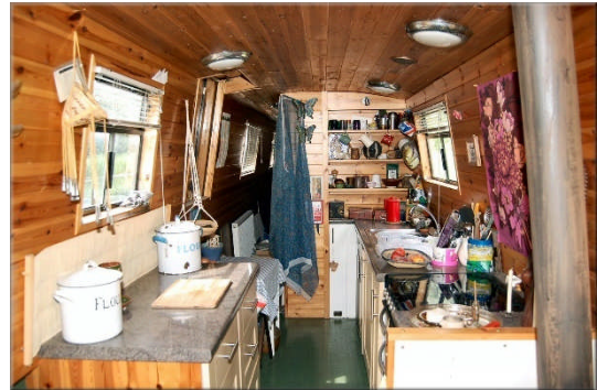
Cabin 4 Galley. Black granite effect laminate work surface over timber effect cupboards and drawers below. Inset single bowl stainless steel sink and drainer. Spinflo 4 burner gas cooker with oven and grill below. Shoreline 12v refrigerator below work surface. Storage shelves on aft bulkhead. The galley is open plan to .....