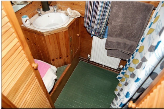
Cabin 2: Bathroom. Step in shower with shower rail and shower curtain. White hand basin set into work surface with cupboard below. Pump out toilet. Passageway continues forward into .....