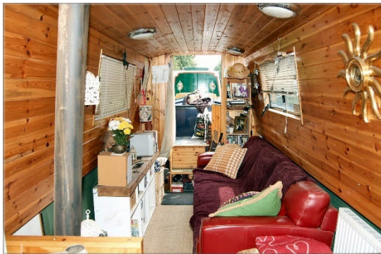
Cabin 5 Saloon. Morso squirrel solid fuel stove is mounted on a timber trimmed hearth to port at the aft end. The saloon is furnished with free standing furniture, currently comprising a large three seat sofa. Step up to forward well.

This vessel has not been cleared and personal possessions will be removed prior to sale.