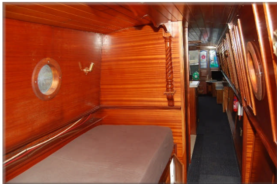
Cabin: The large single bed is lengthways to port with storage below and a reading lamp above. Passageway continues forward into ...