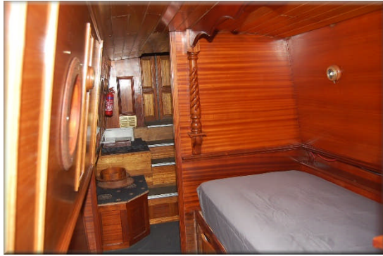
Aft Cabin: The large single bed is lengthways to port with storage below and a reading lamp above. Passageway continues forward into ...