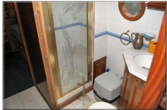
Bathroom: The bathroom is fully tiled in white, at the aft end is a step in shower with door. Thetford cassette toilet and also there is a pump out toilet against the forward bulkhead. To port is a section of marble work surface with round inset sink with storage cupboard below and above. Passageway continues forward into ...