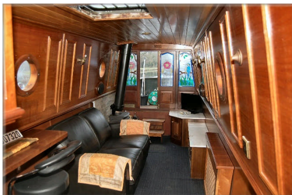
Saloon: At the aft end to port is a fitted breakfast bar / desk with free standing stool. Further is a free standing two seater sofa in black. Fitted storage unit to starboard with marble top and small TV. To port at the forward end is the solid fuel stove.