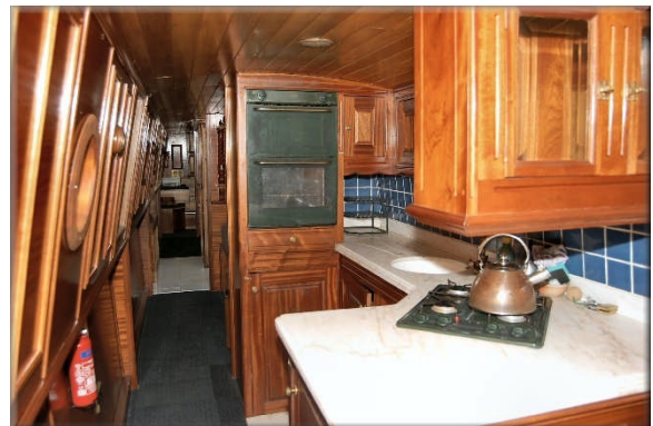
Galley: Located to port of the vessel, marble work surface with mahogany cupboards below and above. Inset single bowl sink unit. At the aft end is a tower unit housing a Vanette grill and oven. At the forward end as an inset 4 gas hob burner. Open plan into ...